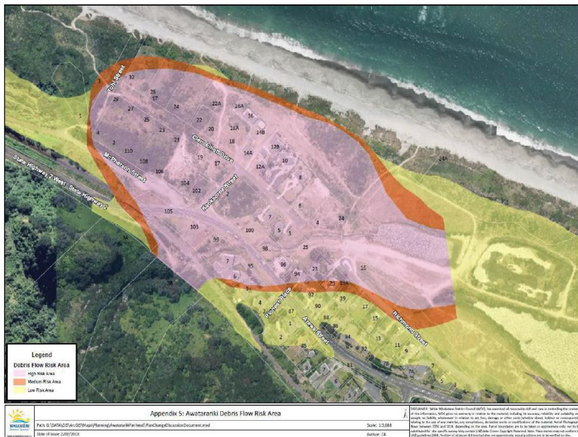
Figure 3: High, medium and low risk areas at the Awatarariki Fanhead, Matatā

Because of existing use rights under section 10, the changes to the Whakatane District Plan are only effective at managing new development or redevelopment in the Awatarariki Fanhead. Owners of existing dwellings can continue to use these dwellings so long as the effects of that use are the same or similar in character, intensity and scale to the effects when the PC1 rules take effect.